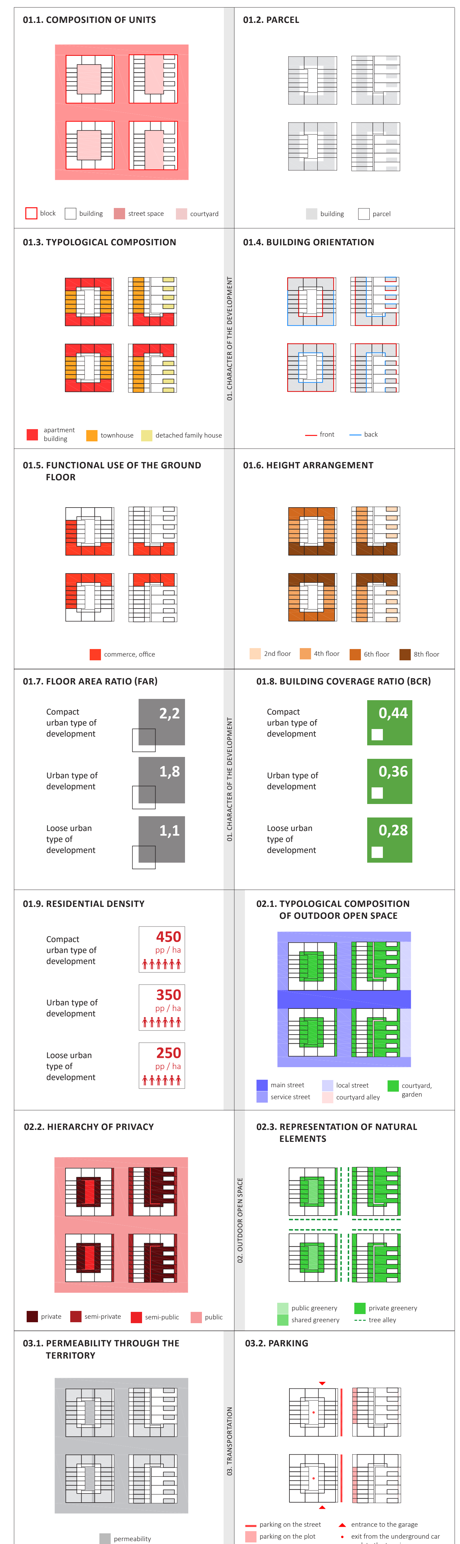
Fig.2 Development plans in European context